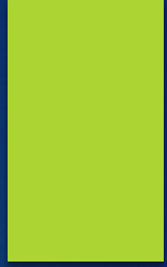
Average Daily Population By Month