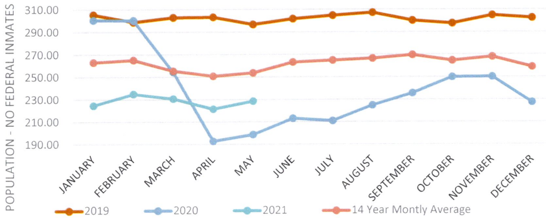
Annual Capacity Study