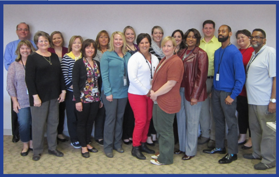
Launching pages on Facebook, Twitter, Instagram, and Pinterest