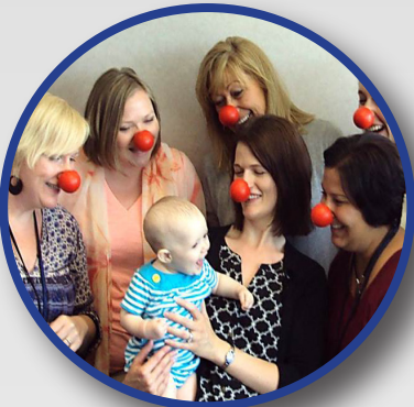
SCHD Celebrates Red Nose Day

Participating in a national day to have fun making a difference for kids