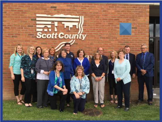
SCHD goes Blue

Raising awareness for child abuse prevention