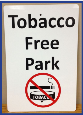
Helping with support, signage and technical assistance