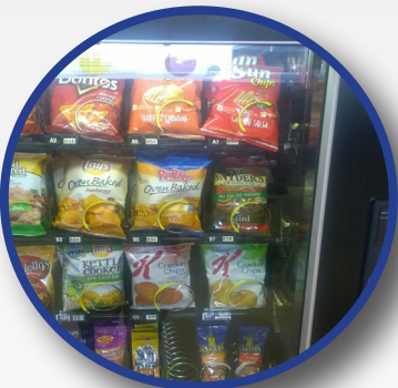
Helping employees choose healthier snacks with labeled vending