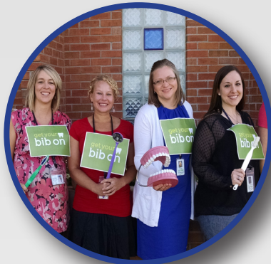
Get Your Bib On

Raising awareness about preventive dental visits